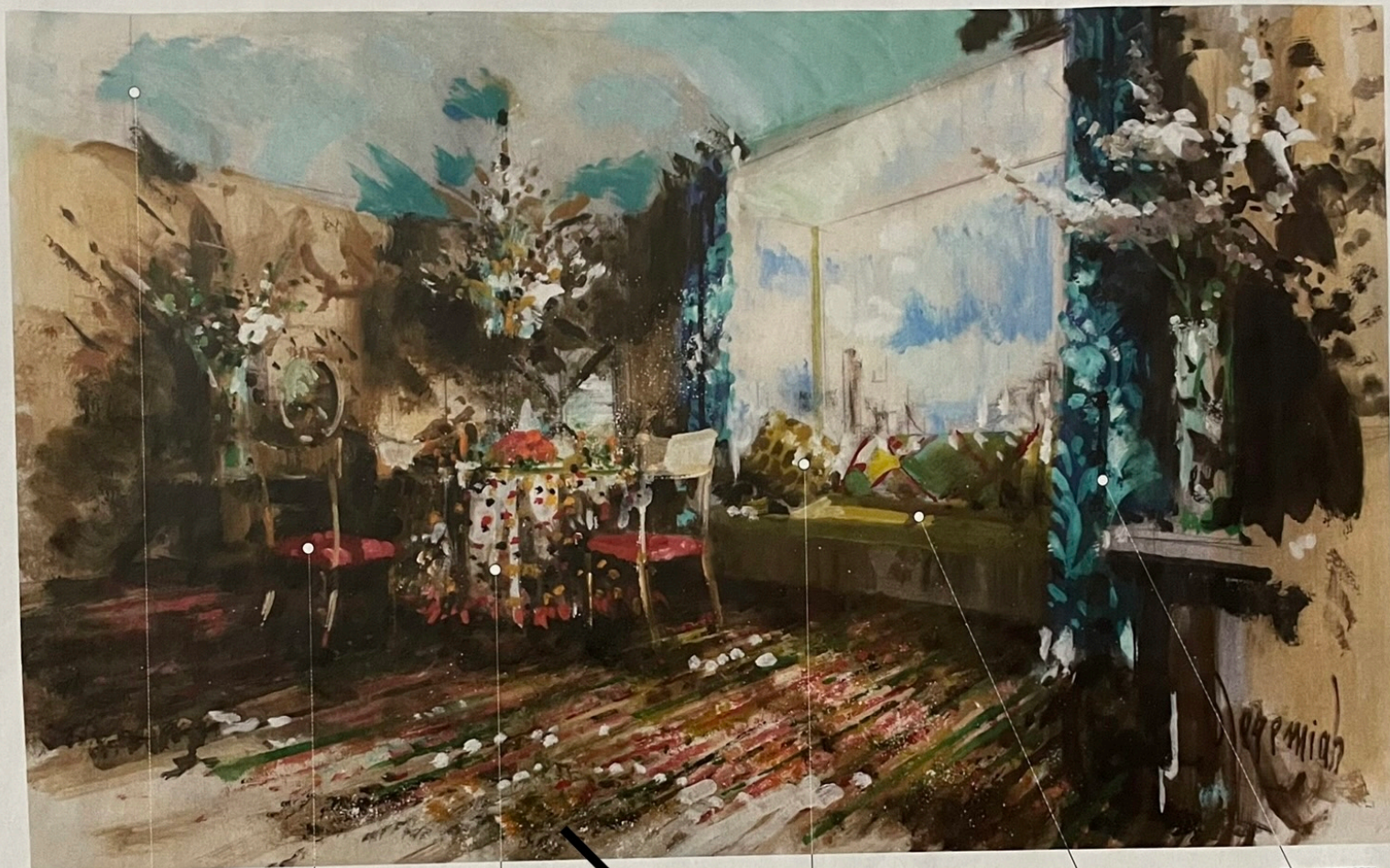
Illustration by JEREMIAH GOODMAN